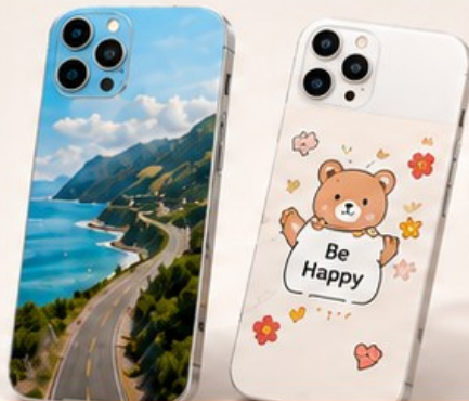
Phone Back Skins