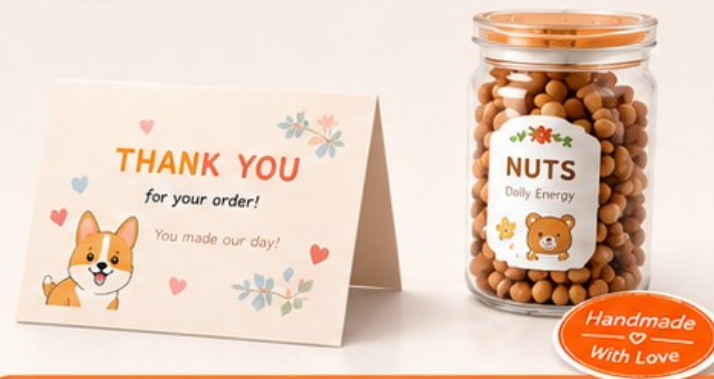
Labels & Cards